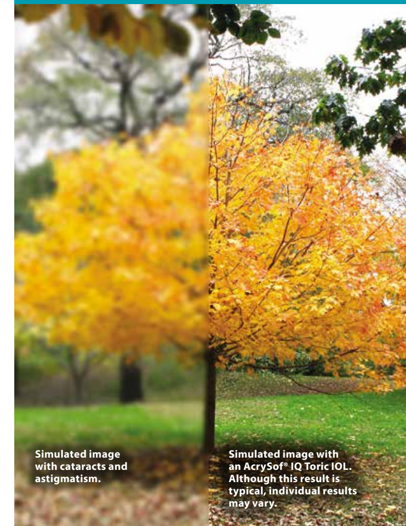
Simulated image with cataracts and astigmatism.